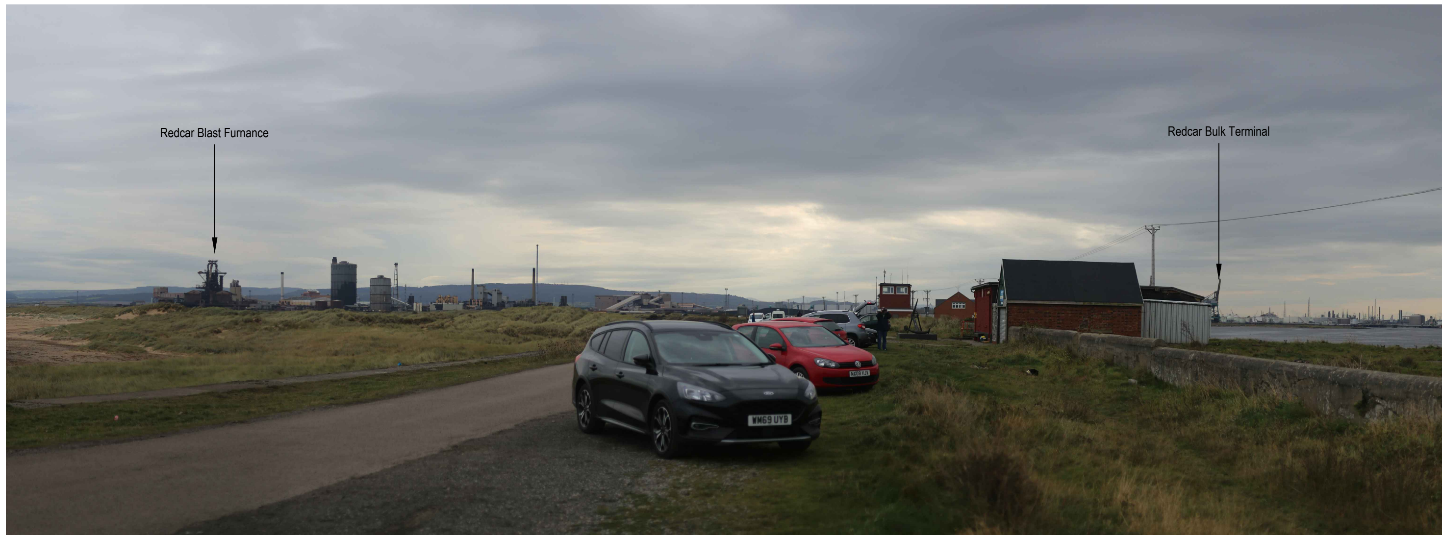
Extent of 50mm single frame image

Project Management Initials: CA Designer: LC Checked: SY Approved: CA