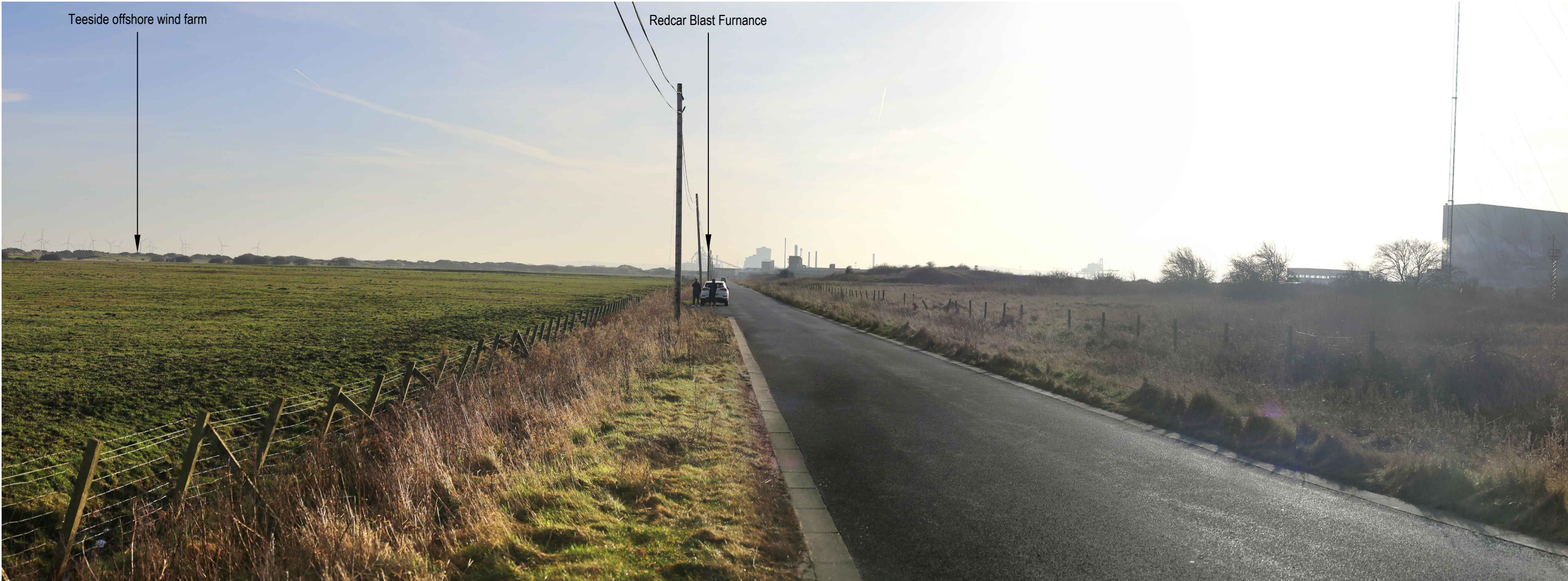
Extent of 50mm single frame image

PROJECT Net Zero Teesside CLIENT NZT Power and NZNS Storage