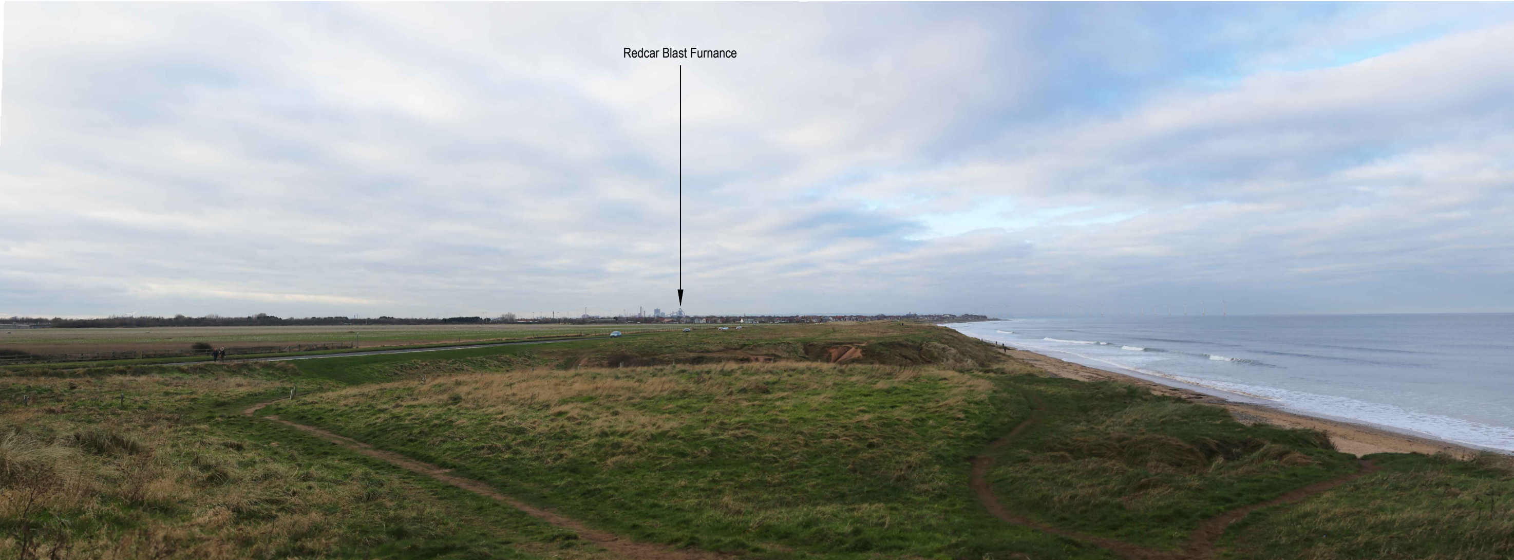
Extent of 50mm single frame image

This image provides landscape and visual context only