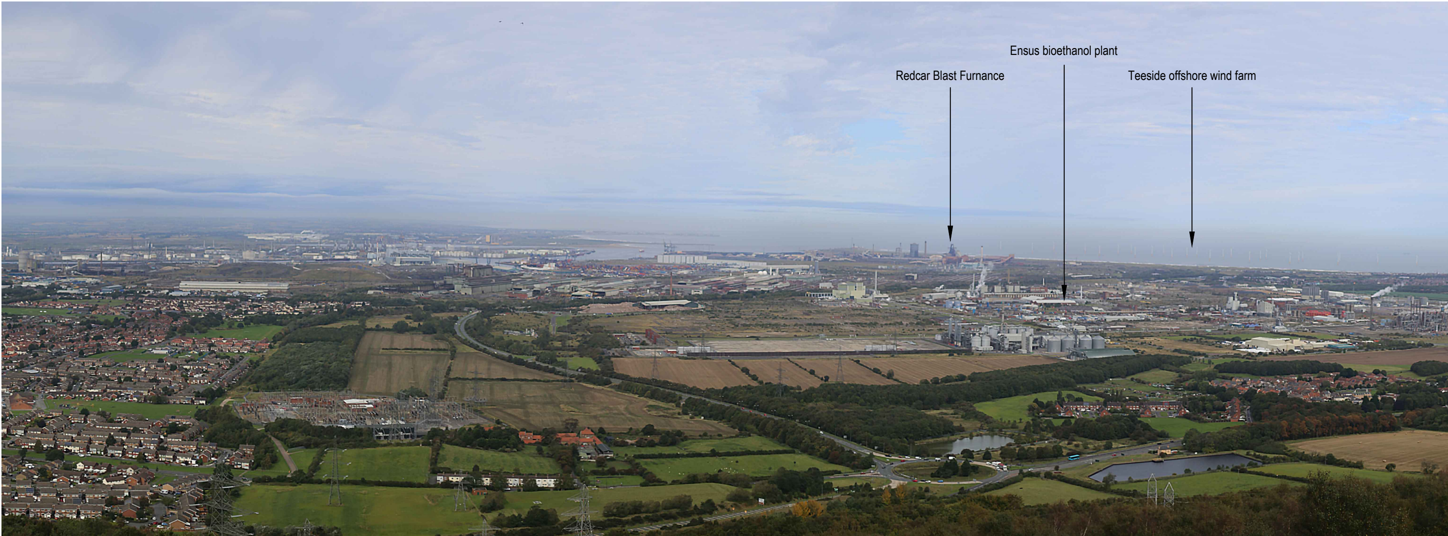
Extent of 50mm single frame image

PROJECT Net Zero Teesside CLIENT NZT Power and NZNS Storage